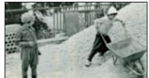
Children helping to rebuild their school

The civil war in Lebanon exploded during the late summer of 1975. As factions fought factions, villages and towns were bombed, shelled and leveled. There was no one area untouched by the fighting. Refugees were rampant throughout the country. Some found shelter at Beit el-Yateem.