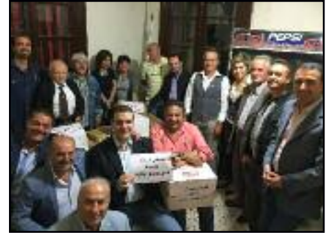
Members of Rotary Club of Aley distributing Boxes of Food during Eid al-Adha