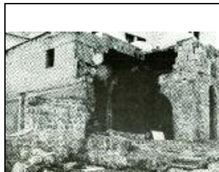
The Sayyed Abdallah Shrine after it was destroyed