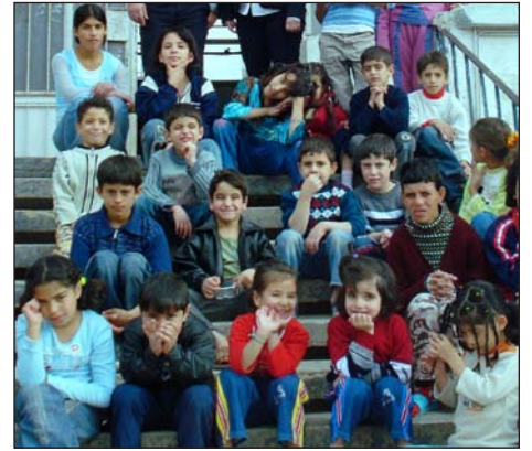
Druze Children in Swaida, Syrian's who have benefited from your donations

To me everything is nice in spite of the difficulties I face every day. But among my new family I found safety and comfort.