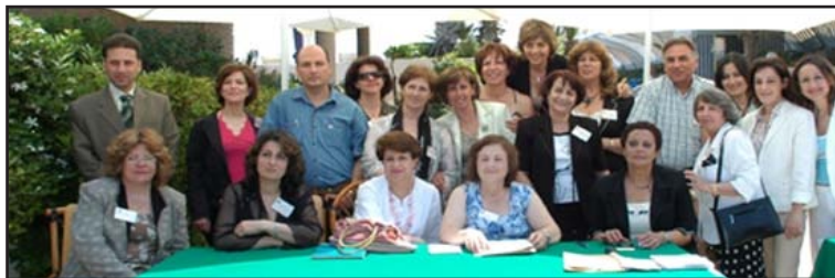
The Volunteers of the Elderly Care Center

Currently, the center is supported by 50 standby volunteers and 15 on weekly basis, who help residents individually, organize or assist in trips in the community, and arrange for birthday parties for residents at the center. They help in organizing and conducting the festivities in June for Grandparents Day through a program designed to provide elders in the community, and from other nursing homes with recreational activities, as well as lunch and other cultural activities.