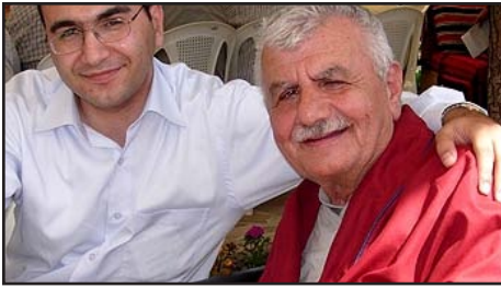
The young visiting their elders

perform their daily activities as much as possible. The Geriatric team is an interdisciplinary team consisting of a geriatrician, general practitioner, social assistant, occupational therapists, physiotherapists, BS nurses and volunteers.