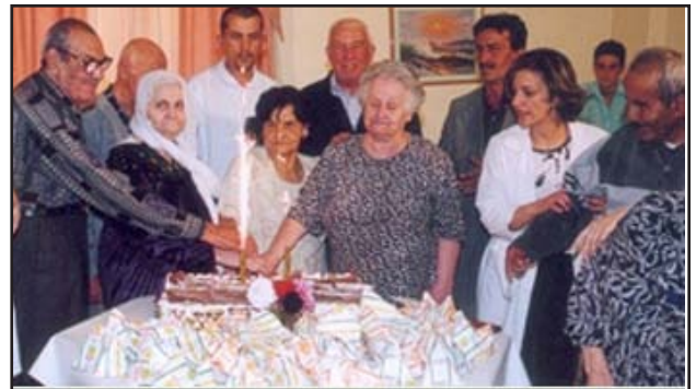
The elderly celebrating a birthday

Psycho geriatric Alzheimer's Unit: This unit aims at improving the elderly mental abilities and psychological status in order that they manage their own care with the least possible help. It also provides medical, nursing, and psychological support for patients suffering from Alzheimer's disease and other psychological disorders, such as depression. This unit meets the elderly psychological and mental needs, particularly since it provides fenced gardens for the exclusive use of patients.