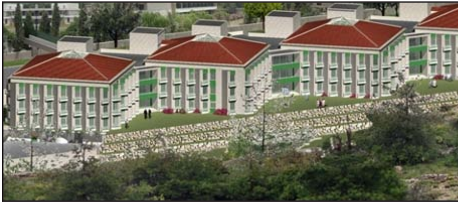
Geriatric Medical Center

The Geriatric Medical Center (GMC) is located in the Chouf region of Mount Lebanon, at 40 km from Beirut and 45 km from Saida. This Establishment's original role was to fulfill the health needs of a region deprived and destroyed by war.